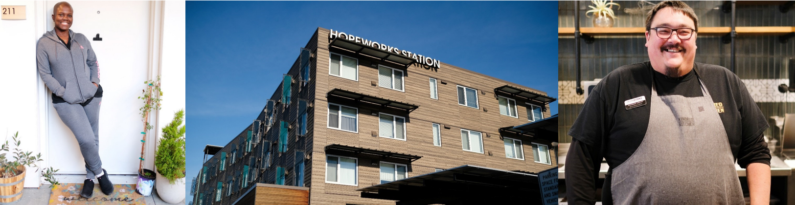
Photo from HopeWorks Station, courtesy of Enterprise Community Loan Fund